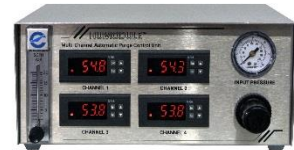
Automatic Purge Control System