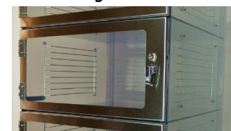
Secure Door w/Cam Lock

*Note: Automatic Purge Control unit designed to automatically control purge system to maintain desired low relative humidity and reduce consumption and cost of inert gas by 70%. (Refer to page 8)