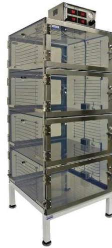
Inert Gas Purging System