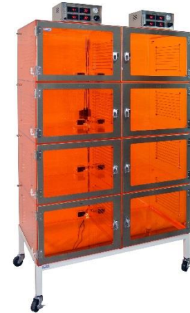
UV Amber Acrylic

Note: These Nitrogen purge desiccator cabinets can be changed to desiccant type (nitrogen-free) cabinets upon request. The Desiccator cabinet can be ordered without back plenum in order to have isolated atmosphere chambers.