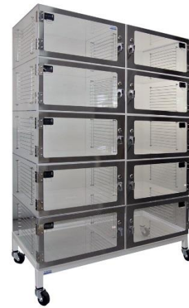
Clear Acrylic / SD PVC