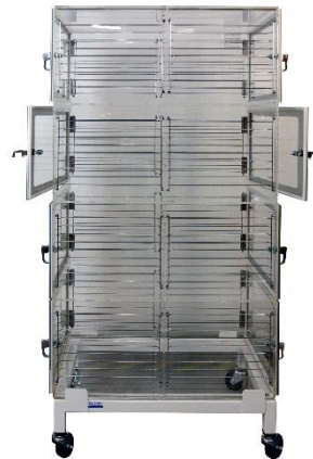
Dual Side Access Cabinets