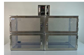
Auto Purge Control Unit