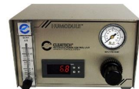
Auto Purge Control Unit