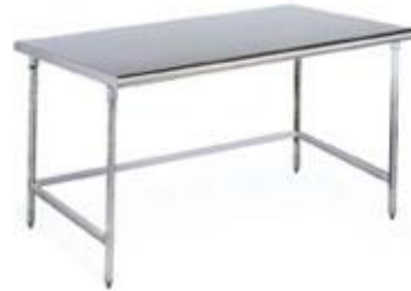
14 Gauge 304 Grade Cleanroom Stainless Steel Tables Perforated top; allow a minimum 40% laminar flow